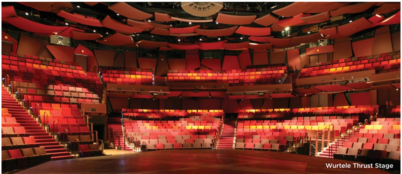
Wurtele Thrust Stage