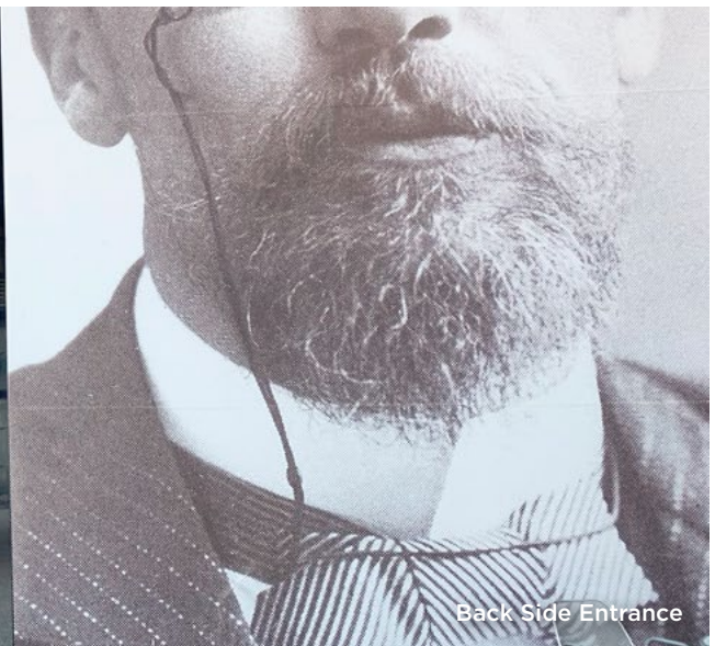
Back Side Entrance