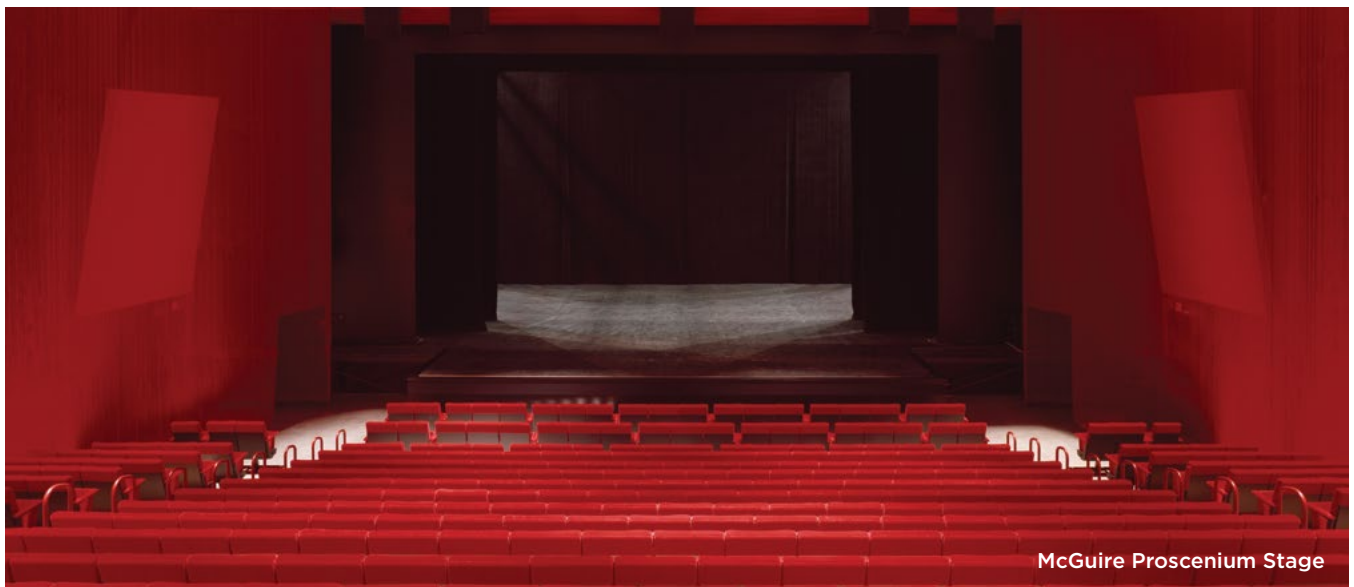
McGuire Proscenium Stage